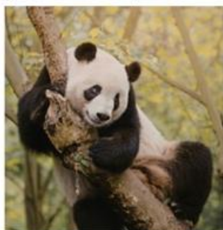
Pictured: Giant Panda climbing a tree.

China has declared that pandas are no longer endangered, and that its national animal has become a global symbol of conservation success. In the 1980s, there were fewer than a thousand of the black and white bears outside captivity. The animal's wild population has now almost doubled! Over the last 30 years, government-led recovery efforts,