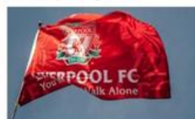
Pictured: Liverpool F.C won the Premier League last year in 2025.

Here's another football news story for you! The Premier League is one of the biggest football leagues in the world and is played in England. Teams play every week, fans cheer loudly, and one winning team lifts a special trophy at the end of the season. The Premier League began in 1992, over 30 years ago. Lots of teams have won it since then, but there is one surprising fact.