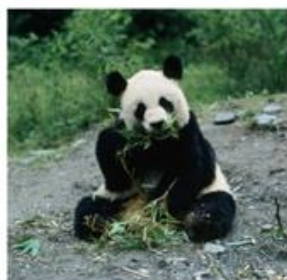
Pictured: Giant Panda eating.