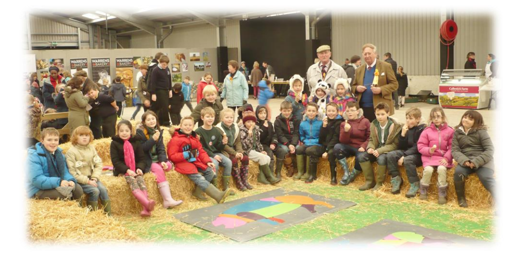
Razorbill's visit to the Royal Cornwall Showground in Wadebridge for their "Food for Farming Day "

The staff work hard to aid the children's understanding of the National and International community. We strive to foster links with other schools and communities outside our own local area, for example our links with a school in Brittany.