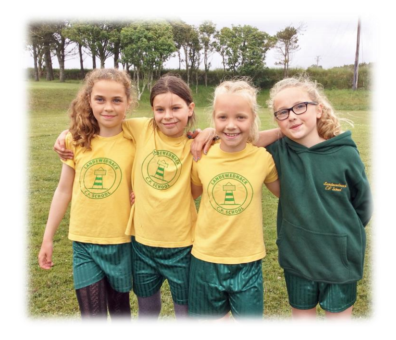
Our school PE kit, yellow shirt, green shorts and the green sports hoodie. All of these items can be ordered online.

Sports Hoodies and Tracksuit bottoms are available to order online, for children to wear over their sports kit to the various sports events in which the school takes part. These are not normal school uniform.