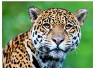
Pictured: A jaguar in the wild.

The number of jaguars is growing! There are now about 30% more of these big cats than in 2010. A new count shows around 5,300 jaguars live in Mexico today. To find them, scientists used special