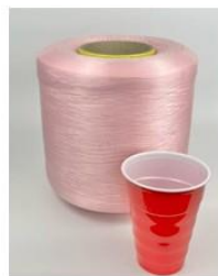
Pictured: Filament yarn made from recycled single use plastic cups.

usually hard to recycle, are shredded and turned into filament yarn. A 3D knitter is then used to create the garments from a single knit. The New Normal collective, from where the items are available, posted, 'A full circle moment ♻️ We made Reynolds Consumer Products Hefty®, the #1 manufacturer of Party Cups, custom beanies [...] with their recycled Party Cups. We use no added dyes and have a zero-water process. The green and blue colour naturally comes from their blue and green party cups 🌱🌱'