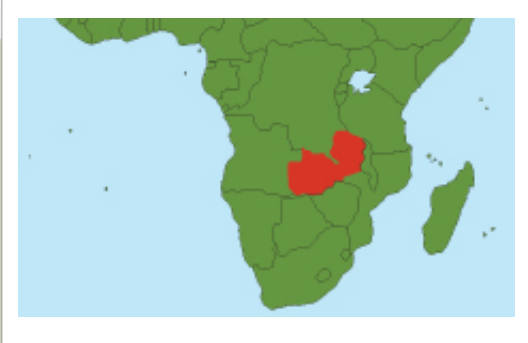
Zambia is in southern Africa

Take a look at a map or globe. Can you find Africa?