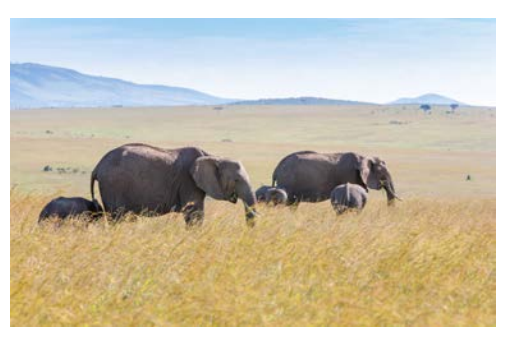
Grasses grow tall in the wet season in Zambia