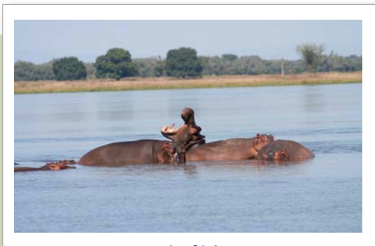
A pod of hippos

Elephants, hippos, buffalo, giraffes, lions and leopards all live here.