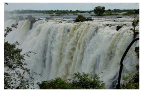
The River Zambezi tumbles over Victoria Falls

The Zambezi flows over Victoria Falls, one of the world's largest waterfalls.