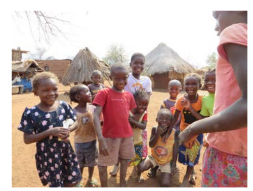
A village in Zambia

Thousands of people work in mining in Zambia. Precious stones such as emeralds and a metal called copper are found deep underground. An area in the north is called the Copperbelt. Here, lots of people live in cities and towns. They're very busy places!