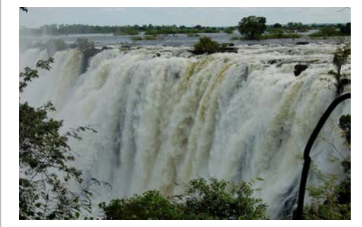
The River Zambezi tumbles over Victoria Falls

The Zambezi flows over Victoria Falls, one of the world's largest waterfalls. Victoria Falls is also known as 'the smoke that thunders'. Can you guess why?