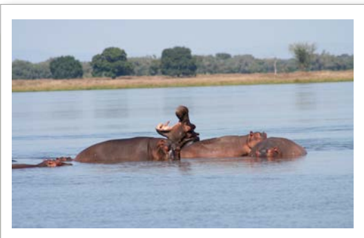
A pod of hippos

Elephants, hippos, buffalo, giraffes, lions and leopards all live here.