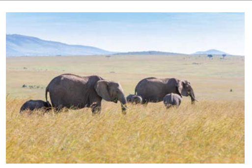
Grasses grow tall in the wet season in Zambia