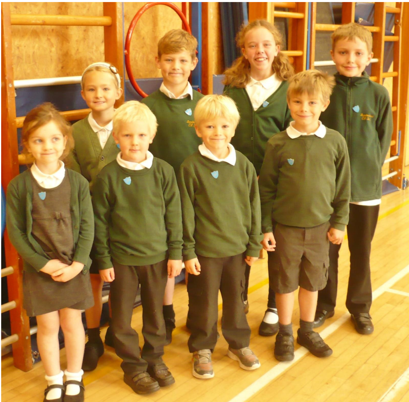
Introducing the Landewednack School Council 2019-20.