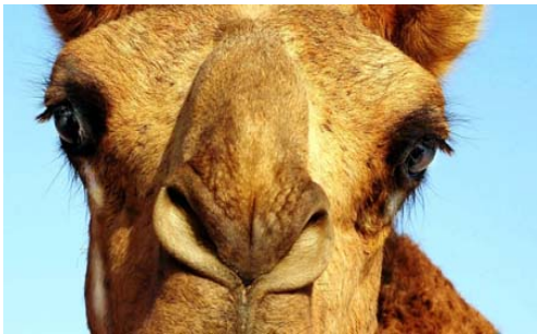
Close up of a camel

Camels, meerkats, scorpions and snakes all live in hot deserts.